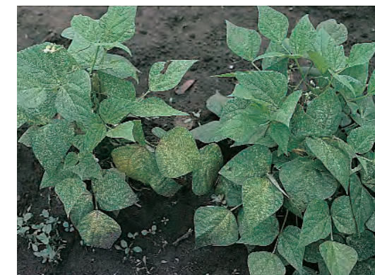
Plate 32: Twospotted mite damage on roses (left); and severe twospotted mite damage on French beans (right)