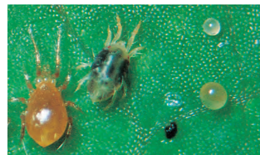
Plate 33: Persimilis adult (left); twospotted mite (centre); twospotted mite egg (top right); and persimilis egg (lower right)

Persimilis is usually found under the lower leaves where the twospotted mites gather, so if sprays of low to moderate toxicity are applied to the upper foliage, predators may not be greatly affected.