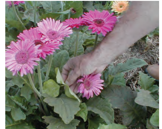
Plate 30: Persimilis mites are supplied on bean leaves, which are placed among foliage.

Ornamentals and cut flowers: One pack of 10 000 per 200–500 m 2 .