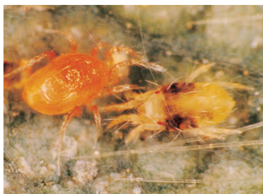
Plate 31: Predatory persimilis mite feeding on twospotted mite

Many cut-flower growers and nurseries have adopted the 'regular release' or 'dribble' method of introducing predators. This ensures that there